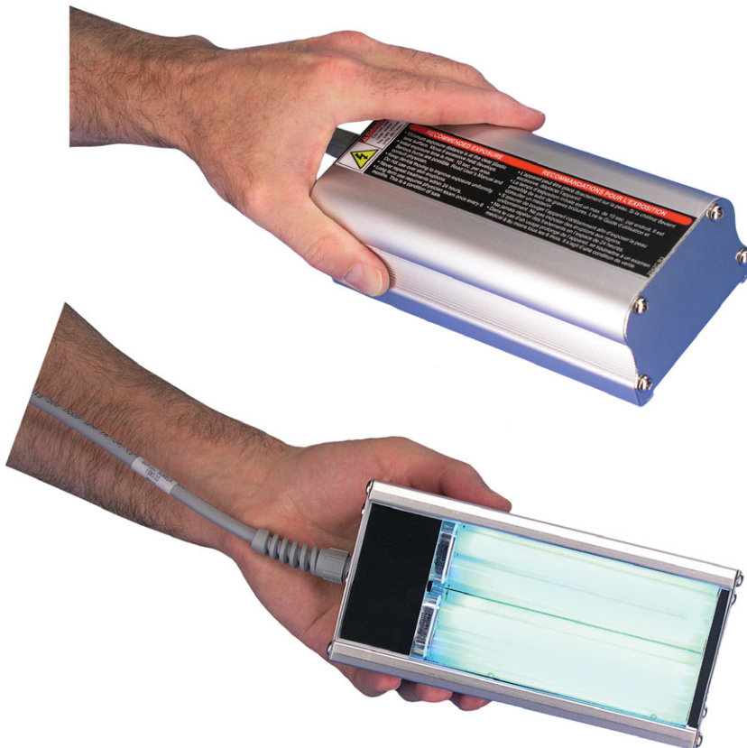
Figure 3 Hand-held phototherapy device

The practice of phototherapy dates back to ancient history. In the past century, there have been great advances in delivering targeted therapy in specific wavelengths that have dramatically changed the management of many cutaneous inflammatory dermatoses. Despite the introduction of potent biological agents for the treatment of difficult-to-manage diseases, the cost-effectiveness, ease, and the relatively safe side-effect profile of phototherapy makes it a