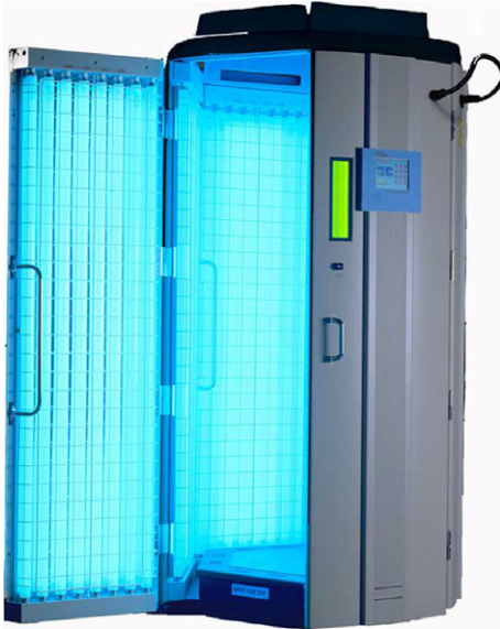
Figure 2 Phototherapy booth

Inconvenience and cost can be curtailed with the use of a home light unit (ibid). Home NB-UVB phototherapy can be as effective as office-based phototherapy, while increasing patient satisfaction with treatment (ibid). Potential side effects and their incidences do not differ significantly between home UVB phototherapy and outpatient pho-