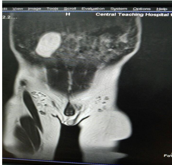
Fig - 2. Sagittal T 2 W image, Rt. sided un descended testis.